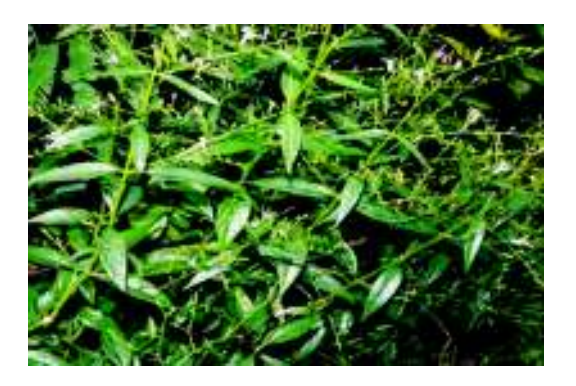
Fig. 1. Specimen of Andrographis paniculata.

Niranjan et al. (2005) obtained seven metabolites from the n -hexane and methanol extracts of Andrographis paniculata . Notable among them are Andrographolide and 14-deoxy-11, 12-di-dehydroandrographolide (Fig. 2) which exhibited anti-HIV action with 50% effective concentration (EC 50) of 49 and 57 \mu g/mL, respectively. The first stage of the clinical test of